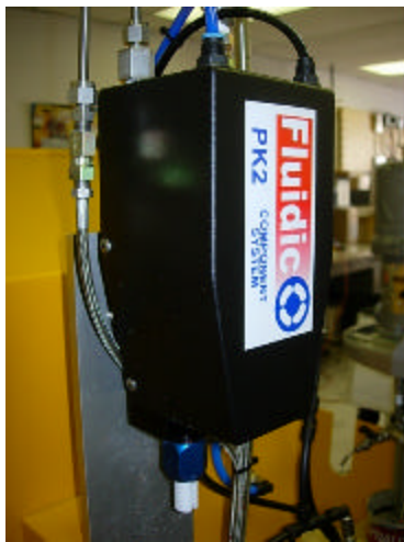
Fluidic 2-Component Dispense Valve Shown with Ratio Check Cap