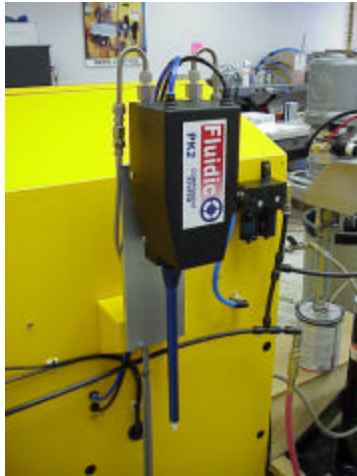
Fluidic 2-Component Dispense Valve Shown with Static Mixer